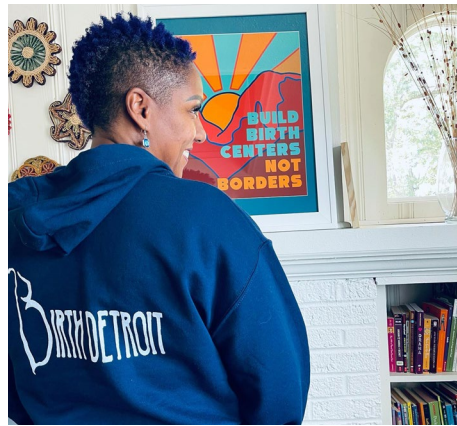
Birth Detroit - Detroit, MI