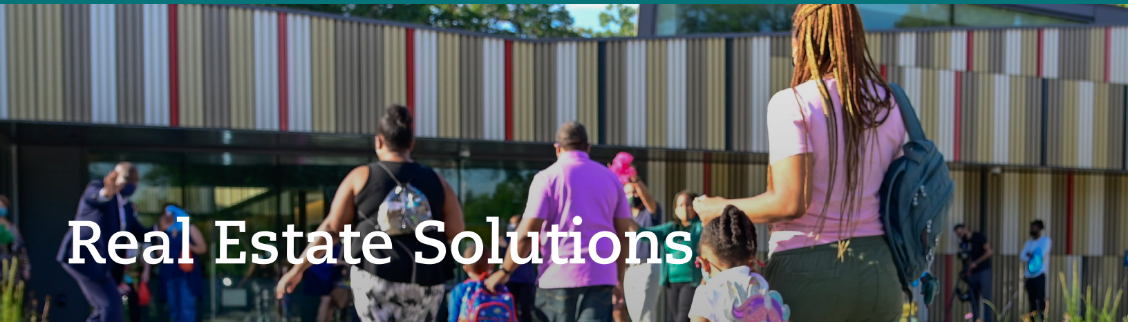
Students and parents walk into the Marygrove Early Education Center for the first day of school.