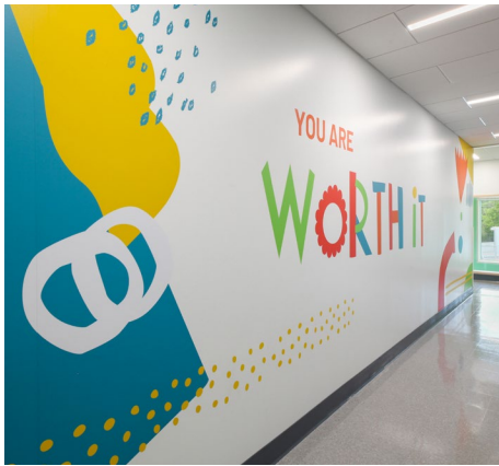
Emmanuel Family and Child Development Center - Kansas City, MO