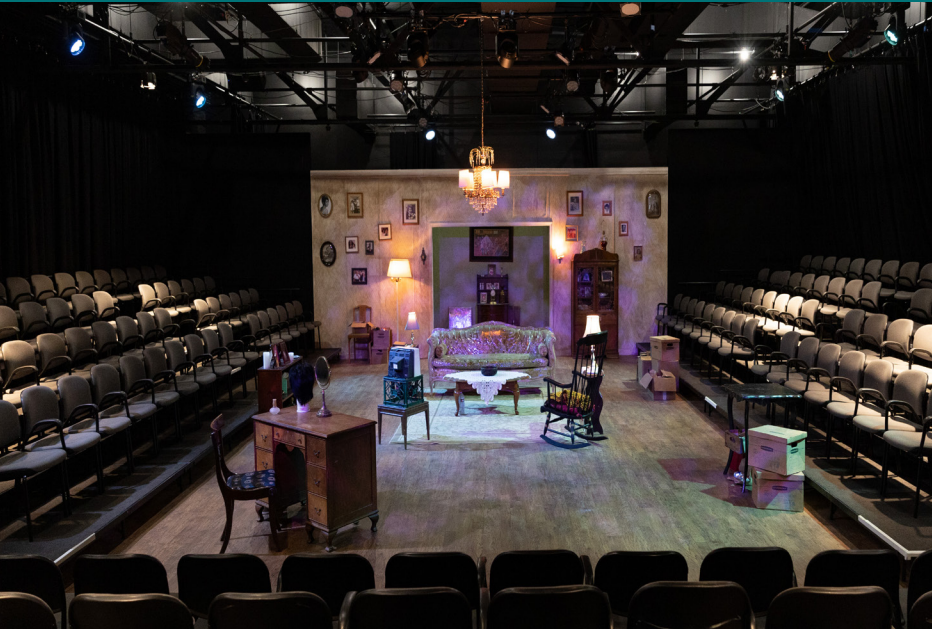
The Detroit Public Theatre used an IFF loan to renovate a building to use as a performing arts space.