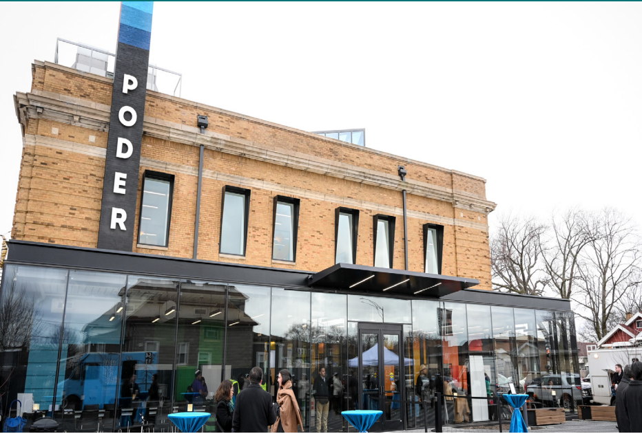
IFF Bridge Loan Client, PODER